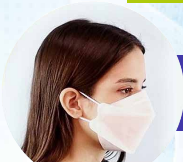
Adult woman wearing a mask

Ergonomic tridimensional structure From the respiratory tracts down to the chin, the mask fits comfortably on the face and remains clean with reduced makeup stains.