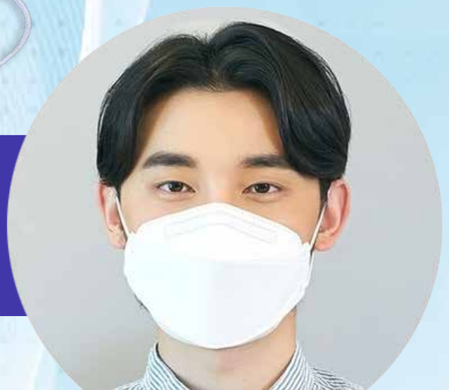
Adult man wearing a mask

Simple design adapted to fundamental needs. Centered on the essential functions of a preventive mask.